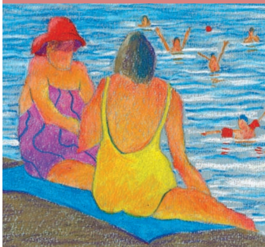
Bathers (Finished drawing 5" x 6")